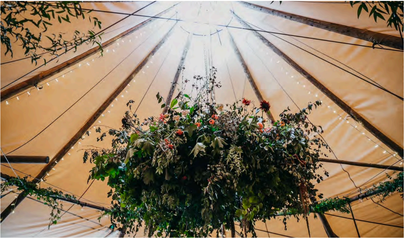
Clear Smoke cap - letting in natural light