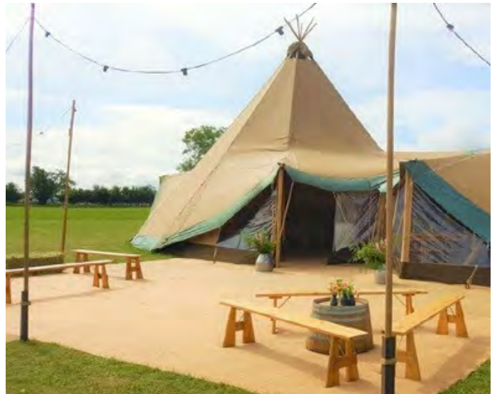
Outdoor Snug - 1 barrel and 4 benches