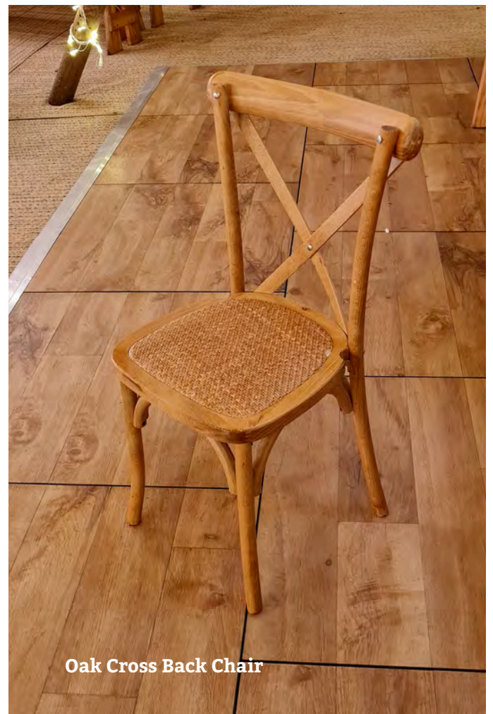
Oak Cross Back Chair