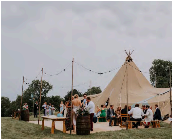
Festoon Terrace - 6 x 10m matting, festoon lights & poles