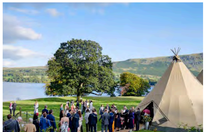
Walkway Matting - 10m