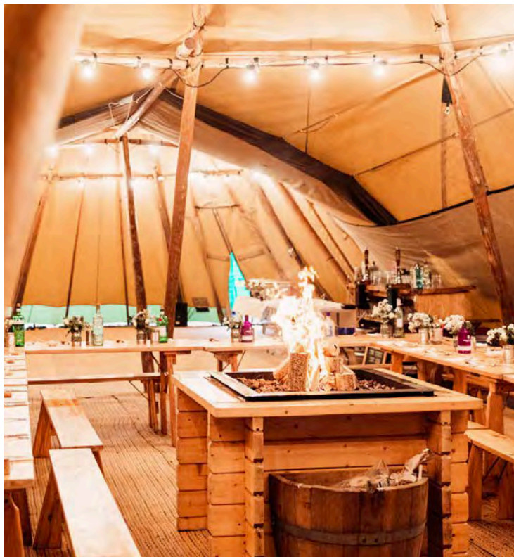
Fitted Festoon with Dimmer