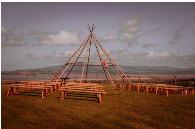
Naked Tipi - 8.3m diameter (inc poles & fairy lights).