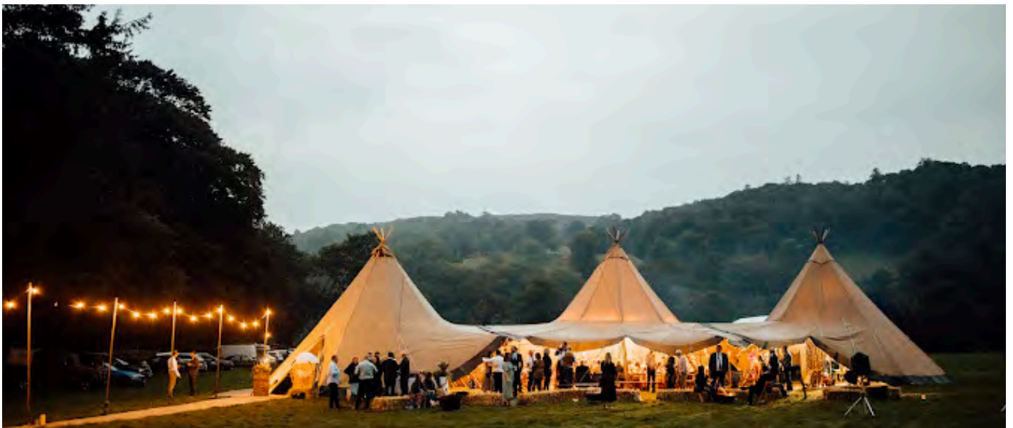
Festoon Walkway - 10m lengths of matting and festoon lighting mounted on poles.