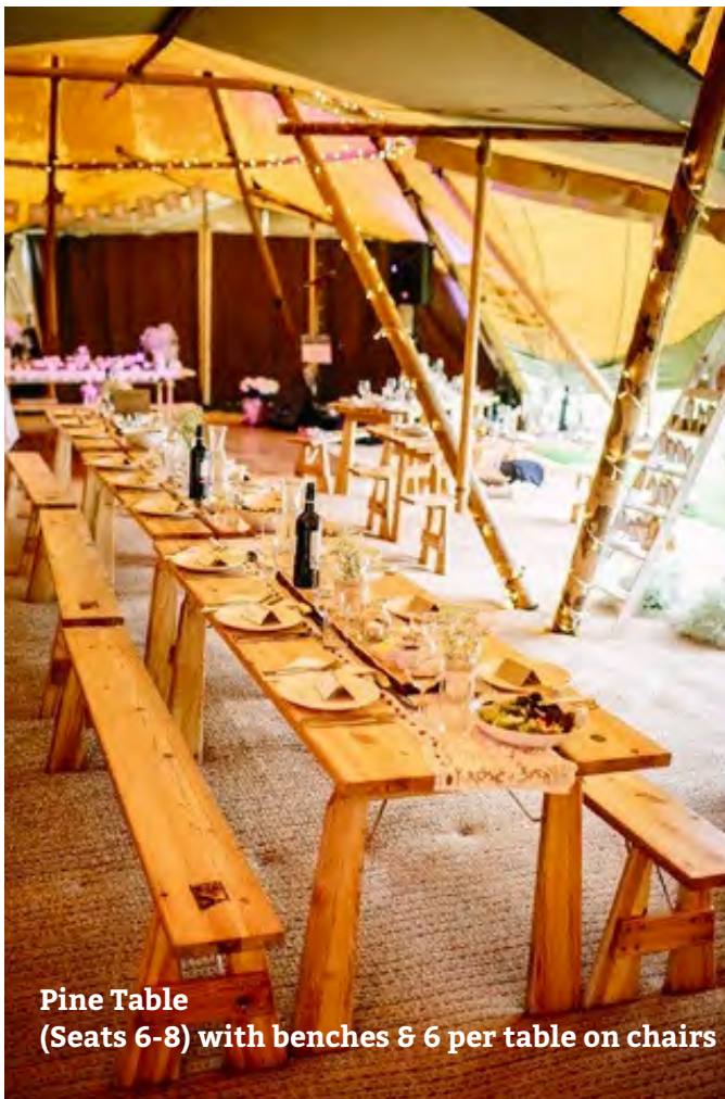
Pine Table (Seats 6-8) with benches & 6 per table on chairs